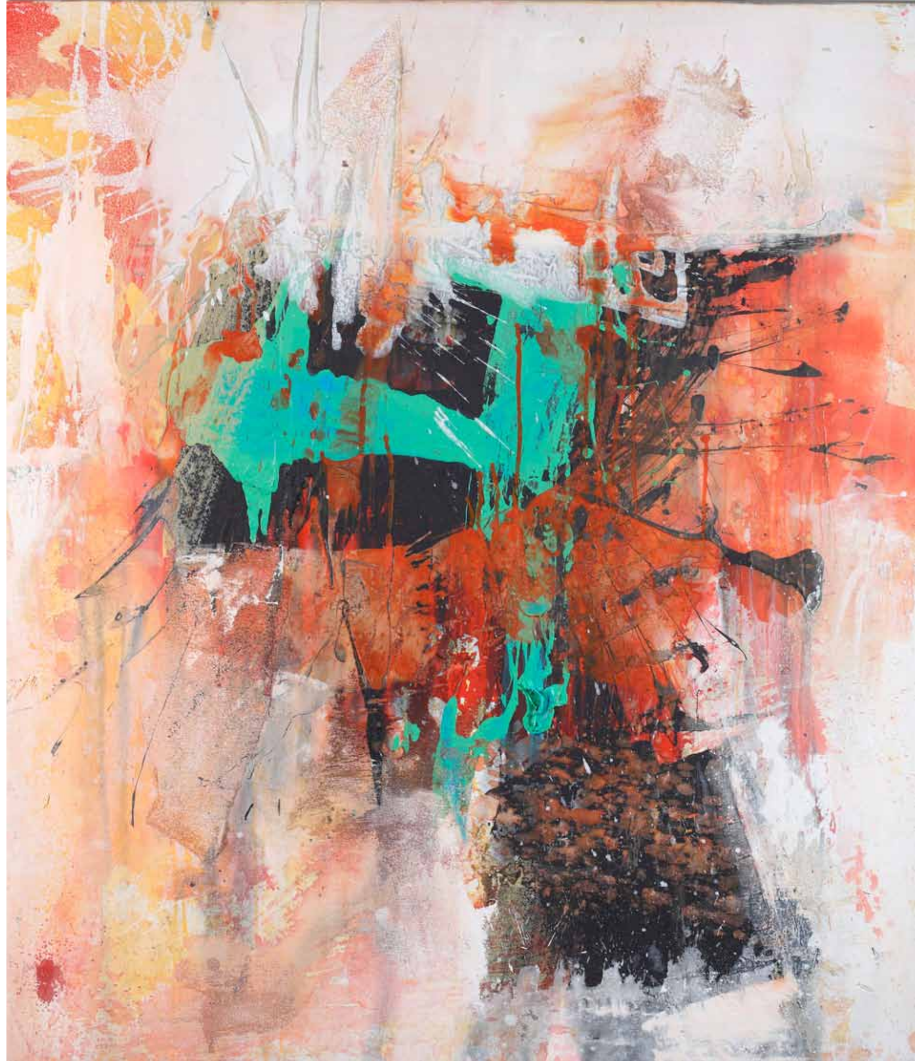
Patrick Bubna-Litic "Green Door" Acrylic mixed technique on canvas 140 x 120 cm 2012