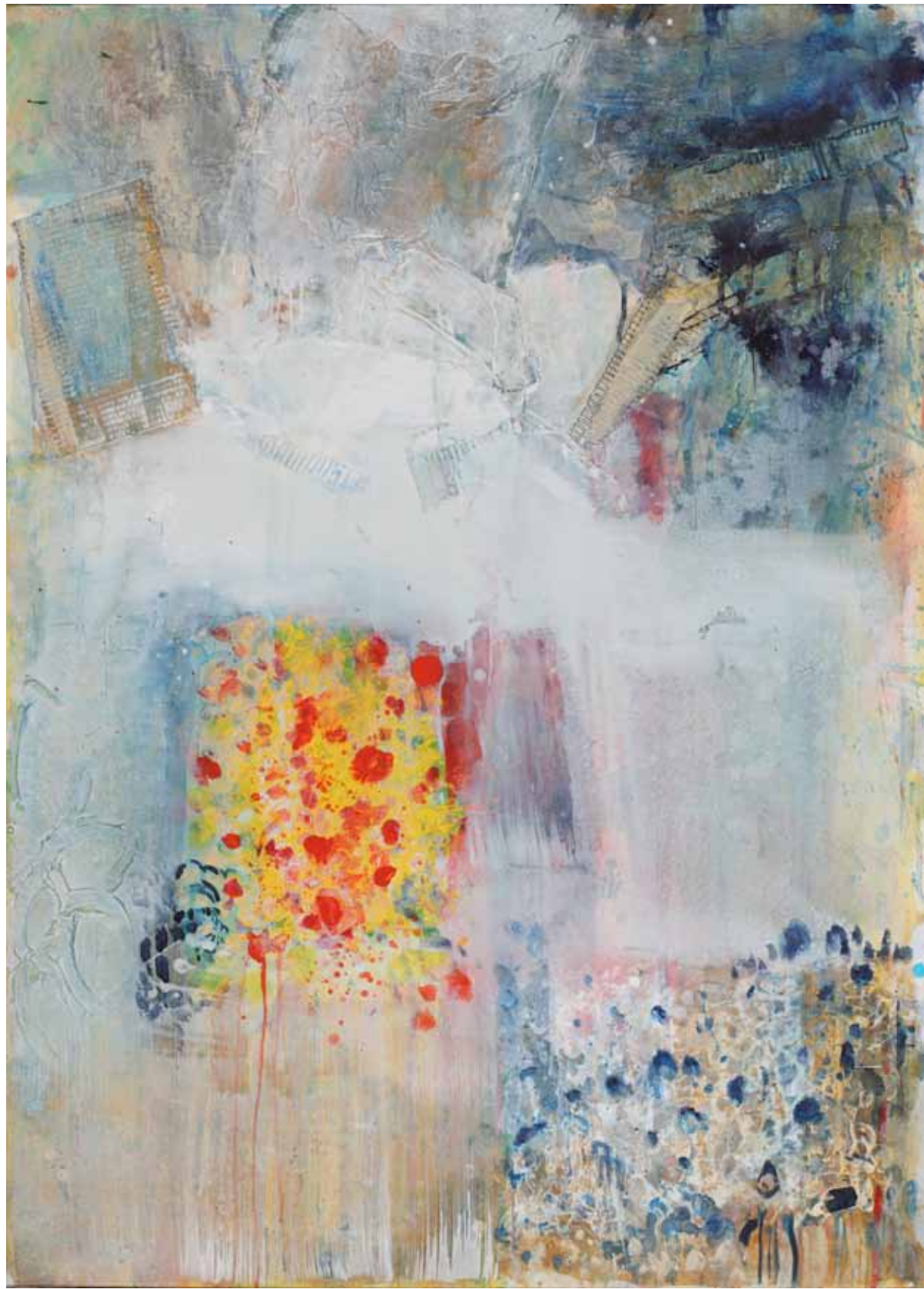
Patrick Bubna-Litic "April" Acrylic mixed technique on canvas 140 x 100 cm 2012