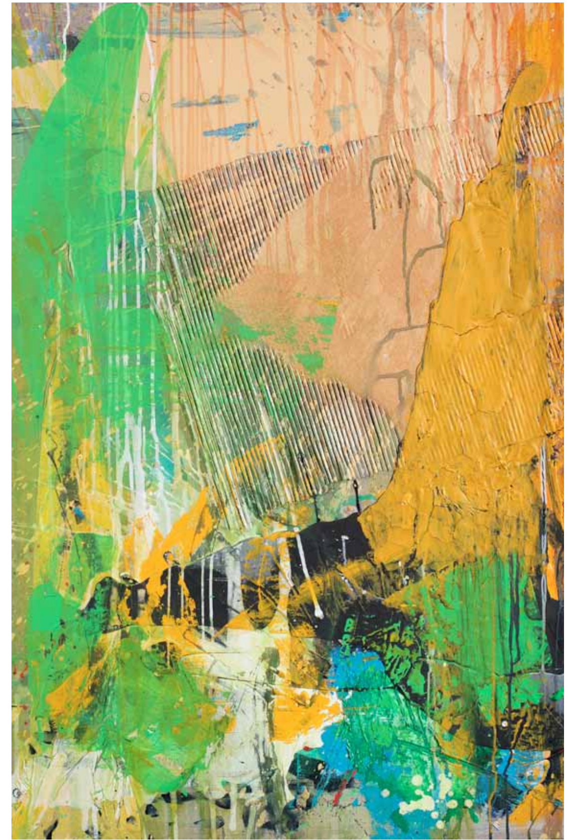
Patrick Bubna-Litic "Run through the Jungle" Acrylic mixed technique on canvas 120 x 80 cm 2012