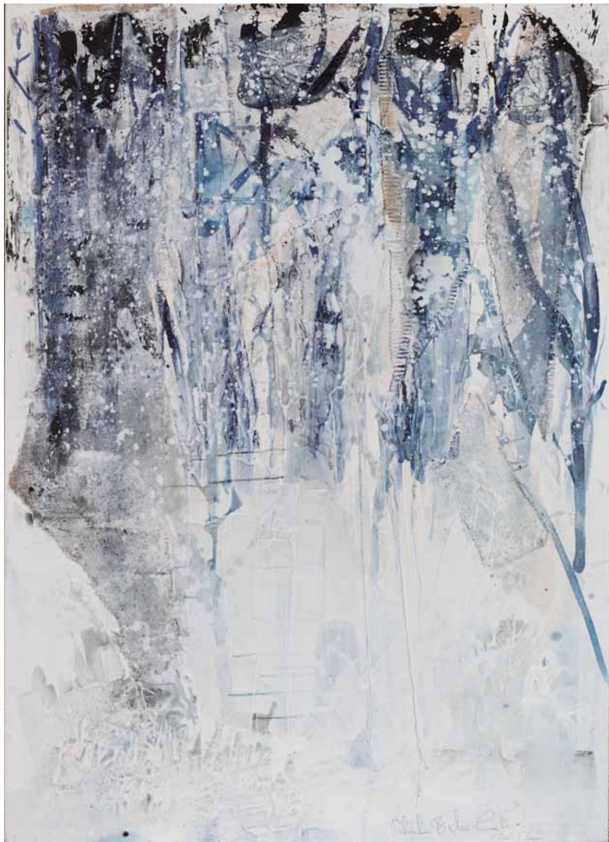
Patrick Bubna-Litic "January" Acrylic mixed technique on canvas 140 x 100 cm 2012