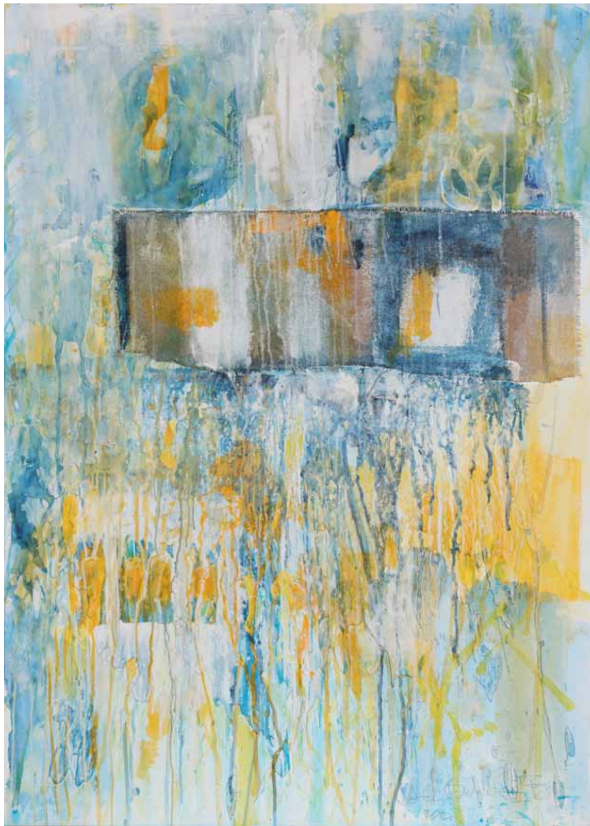
Patrick Bubna-Litic "February" Acrylic mixed technique on canvas 140 x 100 cm 2012