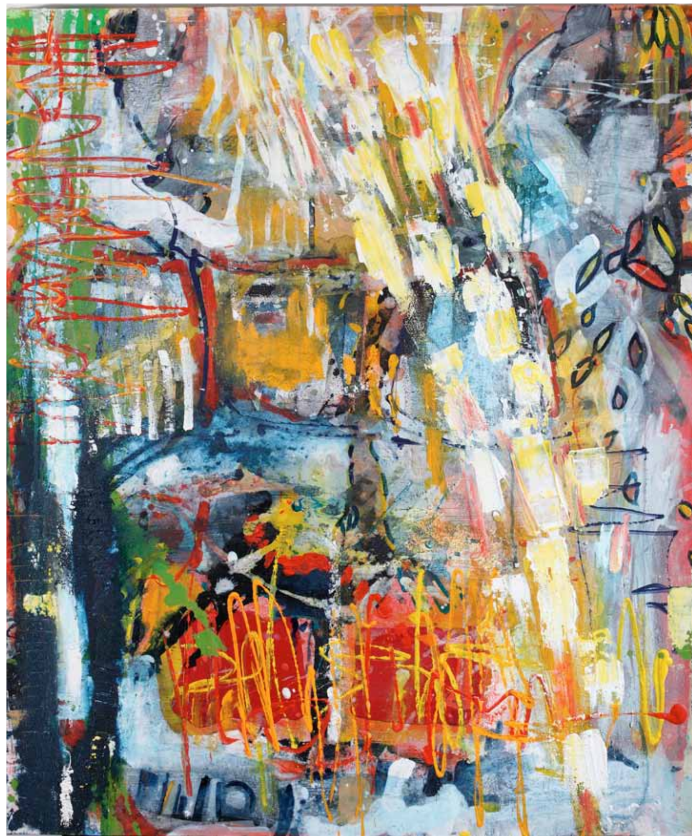
Patrick Bubna-Litic "Jesus Christ Superstar" Acrylic mixed technique on canvas 120 x 100 cm 2010