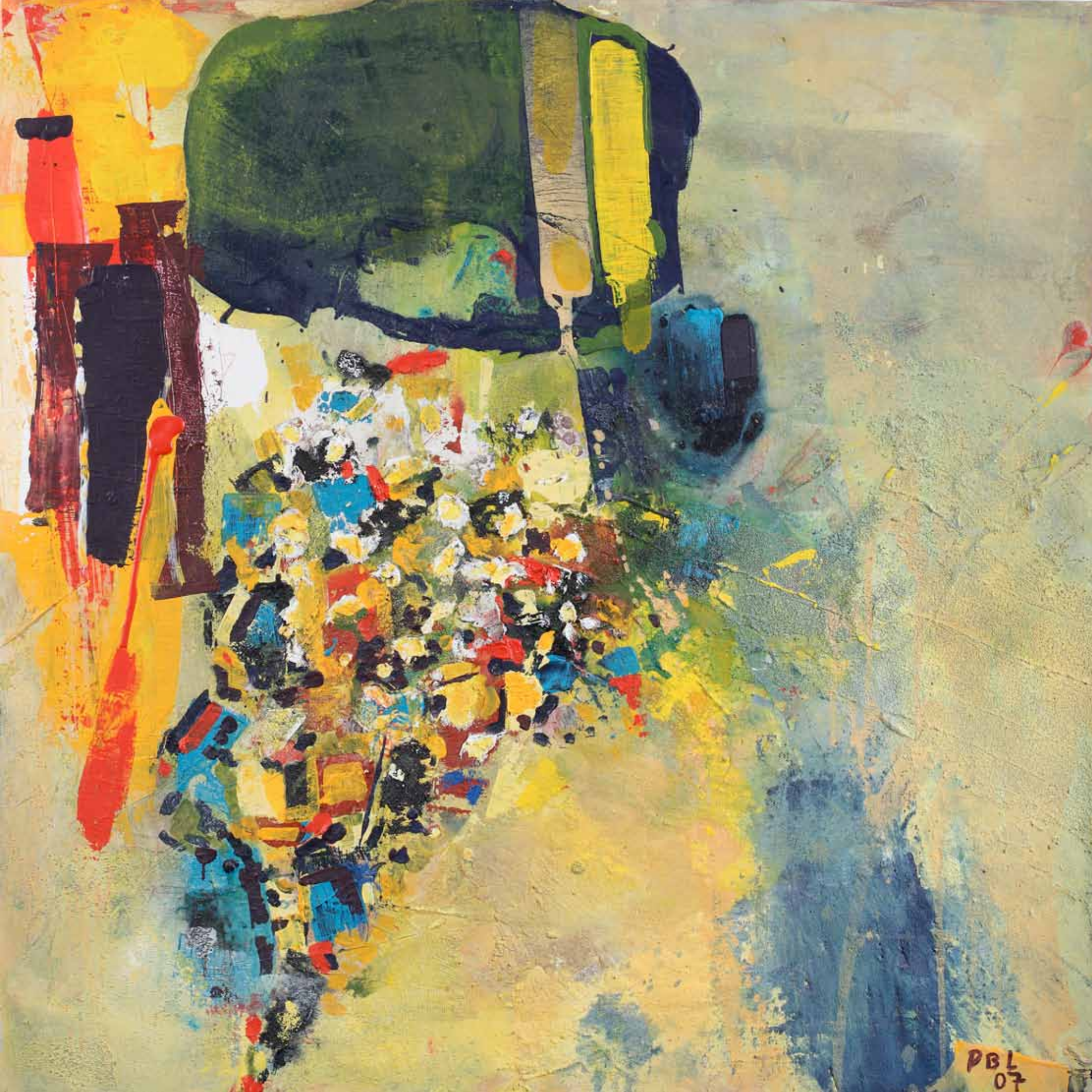
Patrick Bubna-Litic "The Clown" Acrylic mixed technique on canvas 100 x 100 cm 2007